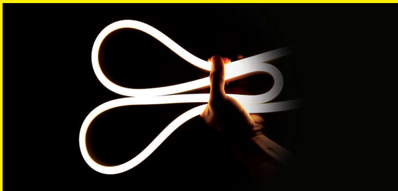
Side View 270deg Mono Colour 15W IP68

R, G, B, Y, O, 22K, 27K, 3K, 32K, 4K, 45K, 5K, 65K