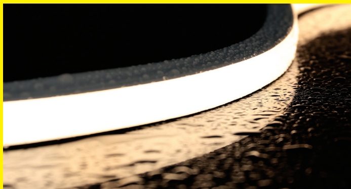
Top View 120deg Dynamic White 10W IP68