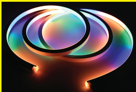
RGBW Pixel Chasing Top View 120deg 18W IP68