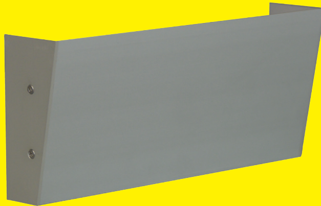
Slim Wall Mount Up/Down Washer